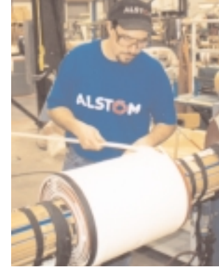
Manufacture of transformer coils at Alstom's Medford plant. Nomex® paper and pressboard are used for the ultrasonically welded cooling ducts and Nomex® paper for the conductor insulation.

Tafanel S.A., a French company specialising in the precision cutting and machining of high-performance plastic materials, produces