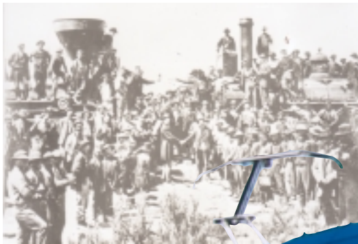
The joining of the Union Pacific and Central Pacific Railroad lines in 1869 created the first rail link between the east and west coasts of the United States.

In Europe, high-speed rail travel already forms part of everyday life for millions of passengers, and travelling at 300 km/h is no longer a source of wonderment. The French TGV, the fastest passenger train in service, showed the way as early as 1981. Since then, high-speed rail tracks have multiplied, putting French cities such as Lyon, Rennes and Nantes within 2 hours travelling time of Paris.