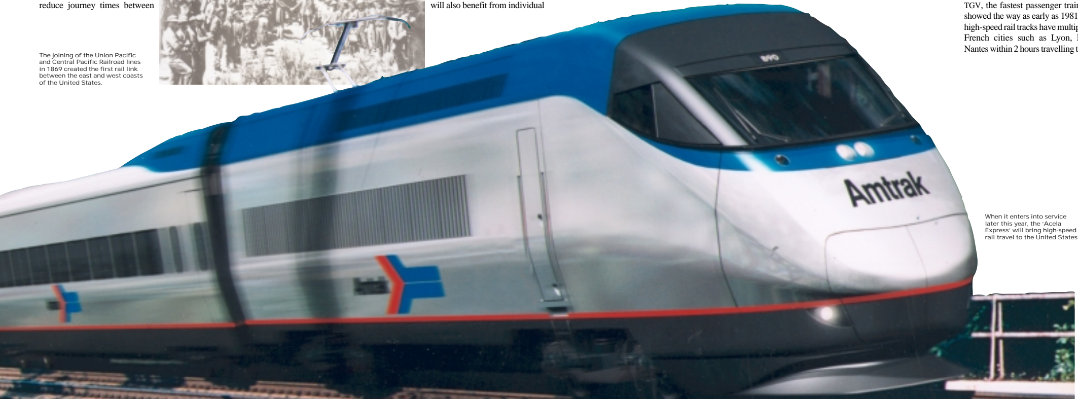
When it enters into service later this year, the 'Acela Express' will bring high-speed rail travel to the United States.