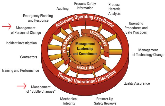
Figure 2. The elements of PSM

Technology: Regulatory Compliance. DuPont classifies the PSM elements in three major groups: facilities, personnel, and technology, as shown in Figure 2.